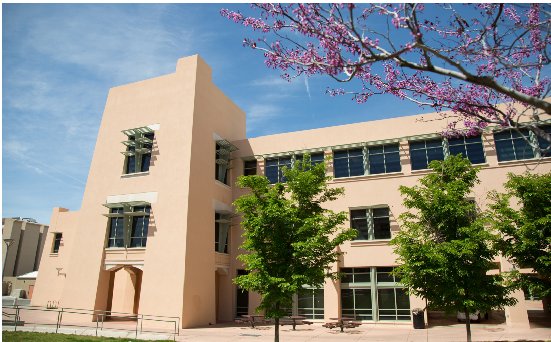
Centennial Engineering Center