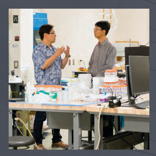
The scope of the project also included the buildout of multiple laboratory spaces in the basement of the Centennial Engineering Center.