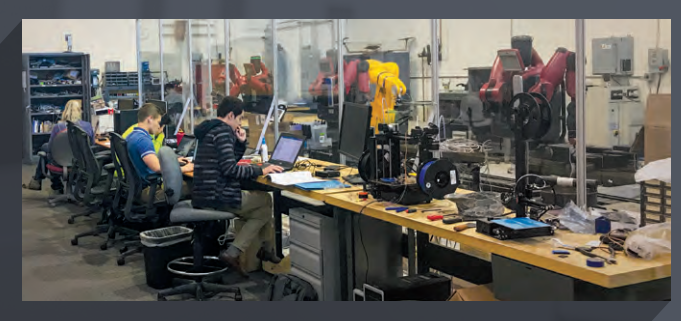
Students in the Agile Manufacturing Laboratory

UNM, AFRL partner on $6.7 million center The University of New Mexico and the Air Force Research Laboratory are partnering on a new center that will focus on agile manufacturing for costeffective and efficient production of small spacecraft and integrated directed energy systems. The $6.7 million center, to be built on UNM's south campus, will focus on four areas: multi-material additive manufacturing; machine learning and transfer learning; machine vision and scene decomposition; and advanced manufacturing concepts. The center will create a strategic relationship between UNM and AFRL New Mexico's directed energy and space vehicles directorates in the areas of small satellite technologies and directed energy systems with a focus on advanced manufacturing concepts. AFRL New Mexico has been active in STEM education for more than 20 years and regularly collaborates with other groups to further STEM throughout the state.